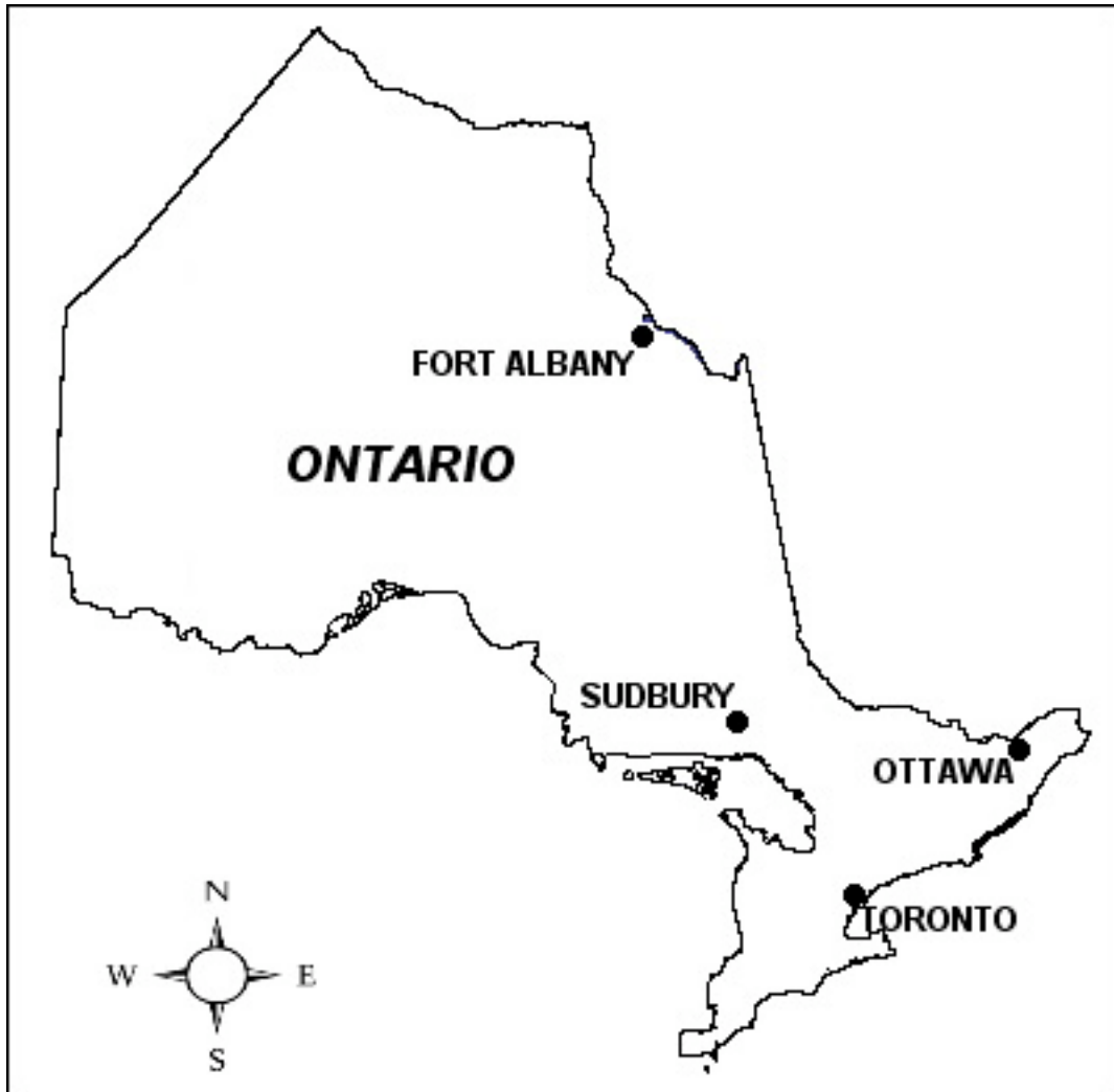
Figure 2. The location of the Fort Albany First Nation within Ontario.