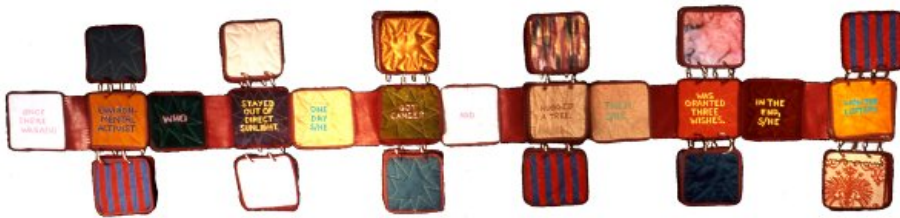
Once Upon a Time - a quilted accordion book with hand-printed text (larger image ( webmus/img/melhorn-boe_oncecopy.jpg ))

For more information about the artist: Queen's Gazette ( http://www.queensu.ca/news/sites/default/files/assets/gazette/gazette20061023.pdf ), October 23, 2006, page 5.