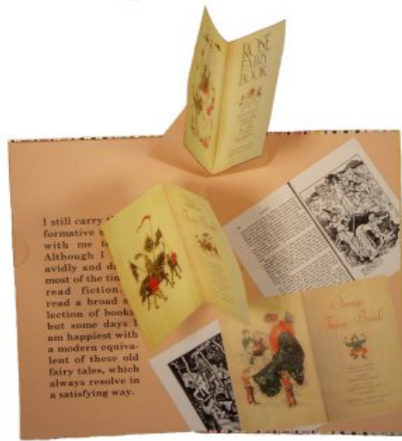
Library Book - a pop-up book with a story by Wendy Cain (artist living in Newburgh, Ont.) (larger image ( webmus/img/melhorn-boe_libraryclean.jpg ) )