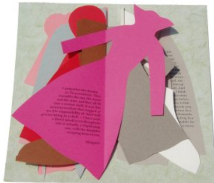
Wake Up the Frog - a paper book with shaped pages and photocopied text (larger image ( webmus/img/melhorn-boe_frogclean.jpg ))