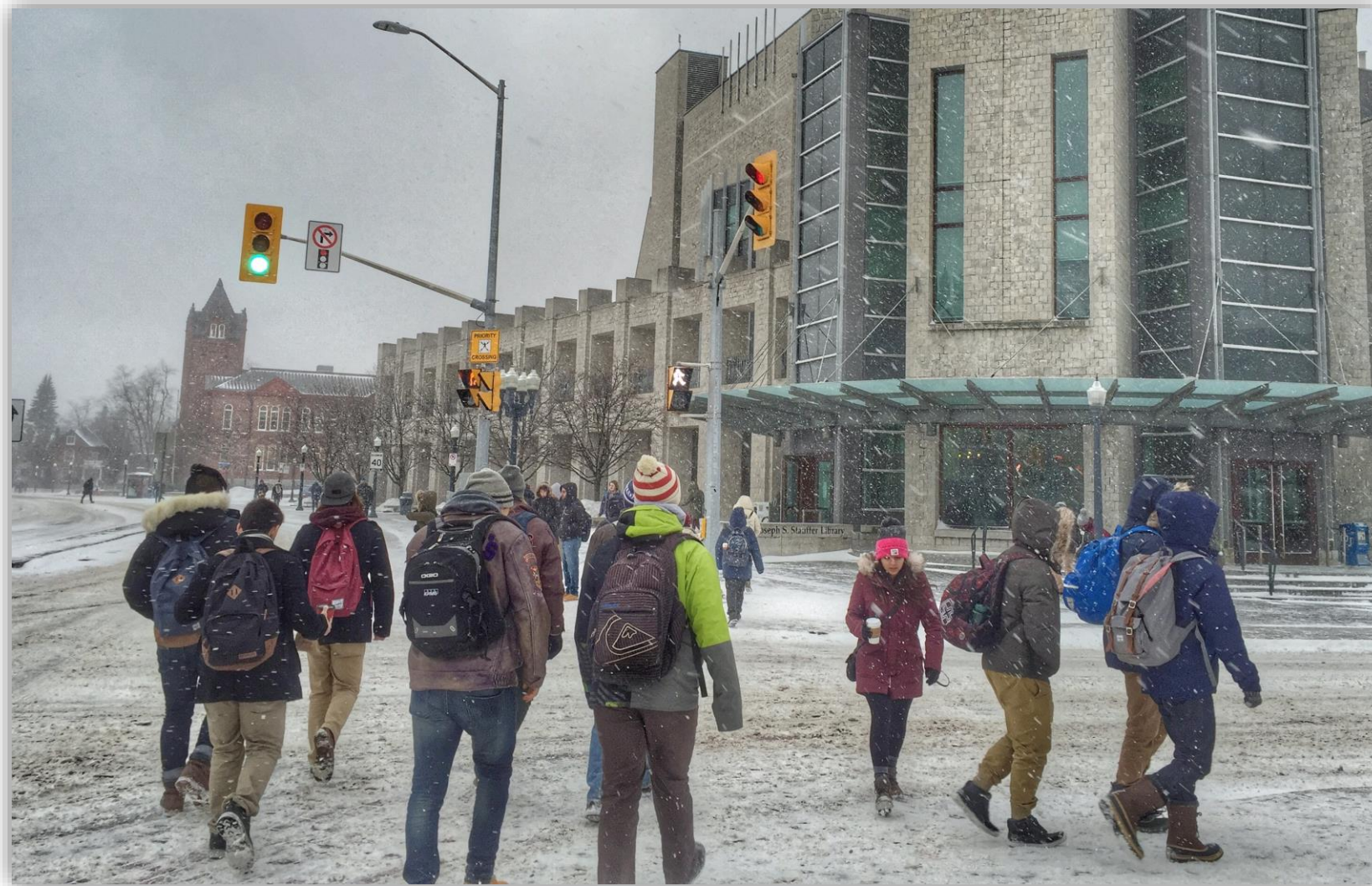
Winter