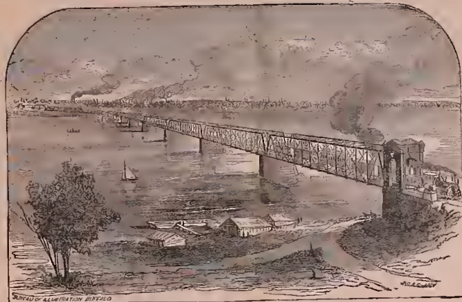
GREAT INTERNATIONAL BRIDGE

Nearly two miles in length. Cost $6,300,000.