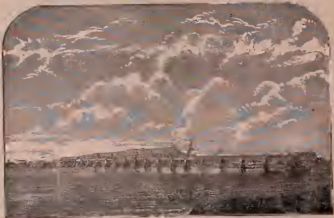
WORLD RENOWNED VICTORIA BRIDGE