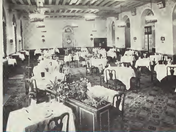
Guests of the Nova Scotian are assured of an excellent cuisine and a high standard of service in this attractive dining room.

The Nova Scotian Hotel with accommodation for 300 persons, all rooms equipped with combination tub bath and shower, is conveniently located in the heart of Halifax, overlooking the Harbour. Adjoining the Hotel is the Canadian National Railways Station — eastern terminus of America's largest Railway System.