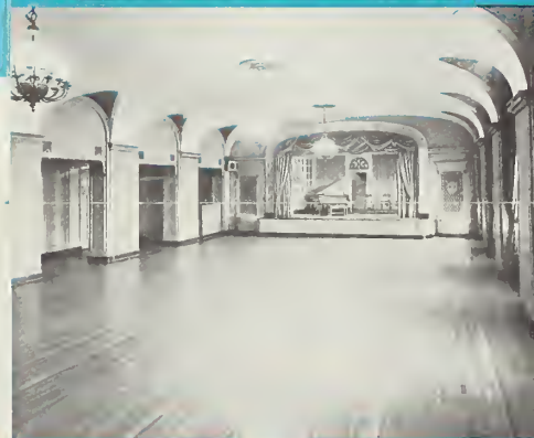
The Bedford Room is a pleasant gathering place. Meetings of up to 200 persons may be held comfortably in this attractive room.

The ballroom, equipped with a well-lighted stage, organ and public address system, is ideally suited for conferences, banquets and social functions of all kinds.