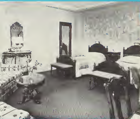
For small receptions and private committee meetings so necessary to modern business, the Nova Scotian's suites are ideal.