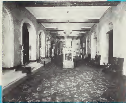
This spacious first glimpse of the Nova Scotian's foyer sets the tone of solid comfort that characterizes the entire hotel.