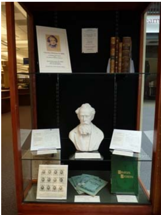
Display in Stauffer Library