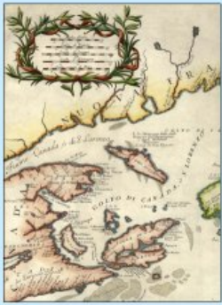
Eastern Canada ca. 1692