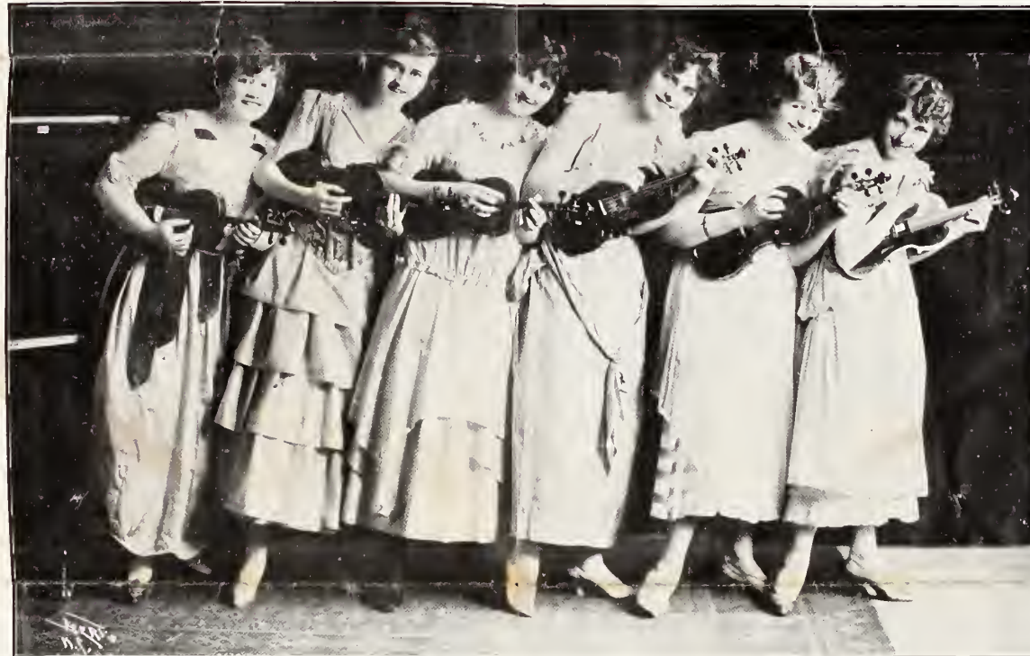
Ladies Festival Orchestra