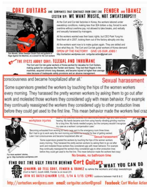
Fig. 1 Cort Guitar Workers’ Action fact sheet made for distributing at NAMM 2011. I have modified this fact sheet by enlarging the section about sexual harassment endured by women workers in order to make this information legible within the context of the overall rundown of issues around which Cort/Cor-tek workers have organized. Used with permission from Cort Guitar Workers’ Action ( http://cortaction.wordpress.com/ ).