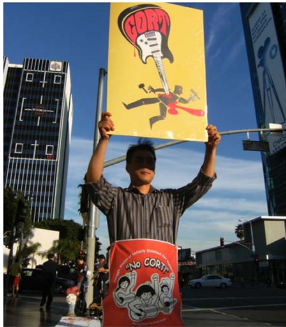
Fig. 4 Photograph of a Cort worker at a protest wearing a “No CORT” campaign poster and holding a print depicting a Cort guitar worker being skewered by the instrument the worker made. The text of the poster being worn like an apron says “Struggle Mission of Unfairly Dismissed Cort Workers” and gives the URL of the Korean-language CGWA blog ( http://cortaction.tistory.com/ ).

Cort workers also made a documentary, which is posted in three parts on YouTube under the title “The Ugly Truth Behind Cort Guitars.” This documentary includes footage of a jazzy song whose introduction goes: “come together, labourers of the world/ the world belongs to us/ not to Park of Cor-tek/ never to Gun-Hee Lee of Samsung/ we already know that the world exists for us all” (“Ugly Truth, pt. 2” 2010). An excerpt of the first video has over 100,000 views, while the full-length version has nearly 60,000, the second part has around 15,000, and the third part has close to 9,000 views. The limited nature of YouTube metadata makes it hard to know where the majority of these people are from, but among the approximately 250 comments on them (combined), nearly all are in English. Some note their location, including: America, Korea, Canada, Russia, New Zealand, Brazil. In content, they appear to be fairly divided between vowing never again to support Cort and fighting with other commenters about the appropriate stance to take in relation to global capitalism. Another English-subtitled documentary—listed in some places as Guitar Story (2009) and in others as Dream Factory —was made by filmmaker Kim Sung-kyun. It was selected for distribution support by the Asia Cinema Fund at the 2010 Pusan International Film Festival, traveled that year to NAMM with Cort workers, and then