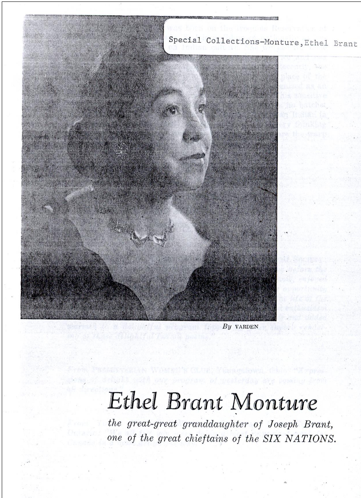
Figure 1: Promotional brochure advertising Ethel Brant Monture as a public speaker and recitalist