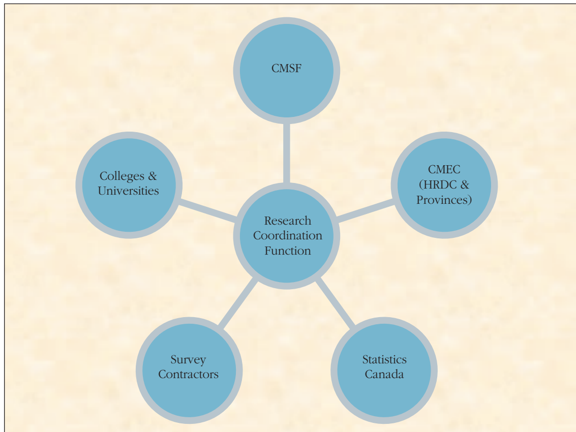
FIGURE 5.1: RESEARCH PARTNERSHIP AND COORDINATION